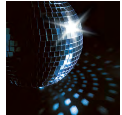
DISCO BALL: $200