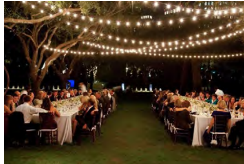
MARKET LIGHTING: $1500+