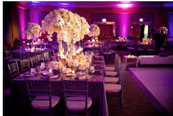
PINSPOT LIGHTS: $50 PER LIGHT