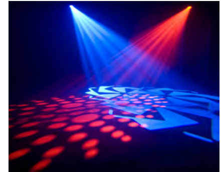
MOVING HEAD LIGHTS: $150 PER LIGHT