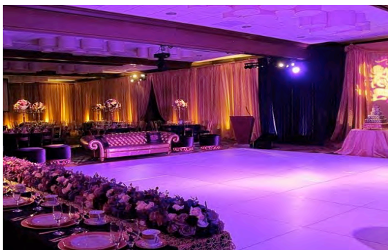
WASH LIGHTING: $200 PER TOWER