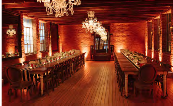
WIRELESS UPLIGHTS: $30 PER LIGHT