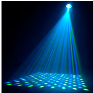
EFFECTS LIGHT: $125