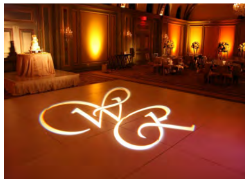
CUSTOM GOBO MONOGRAM PROJECTOR: $400